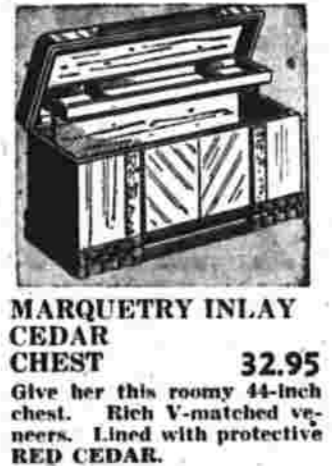
MARQUETRY INLAY CEDAR CHEST 32.95

Good looking maple-finished hardwood frame and homespun upholstery. Spring-filled!