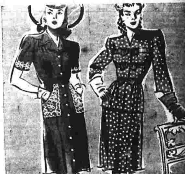
LOVELY SPRING DRESSES 5.98

is right here in our shiny new department. Here are only a few suggestions: Pure Wool Jackets in Classic, Blazer or Loafer Styles... 8.98 Skirts of Rayon or Spun Rayon, as Bright as Spring .....2.98 and 3.98 Blouses and Sweaters for Everyone, Priced From 2.98 to 4.98