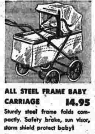
ALL STEEL FRAME BABY CARRIAGE 14.95

Sturdy frame, crutch-like trim, handy pockets... won't tip easily! Attractive! Real convenient!