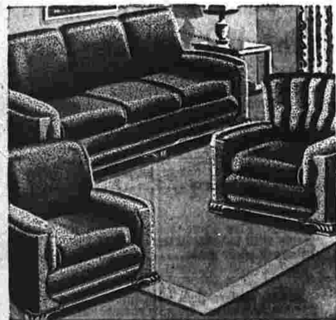
3-PIECE LIVING ROOM FULLY SPRING FILLED 219.95

Completely Remodeled From Basement To Furniture Floor. New Fixtures — New Lighting — New Retail Display Ideas — Many New Items. Spring Begins With Wards Re-Opening. Be One of the First To Visit Our Beautifully Remodeled Store.