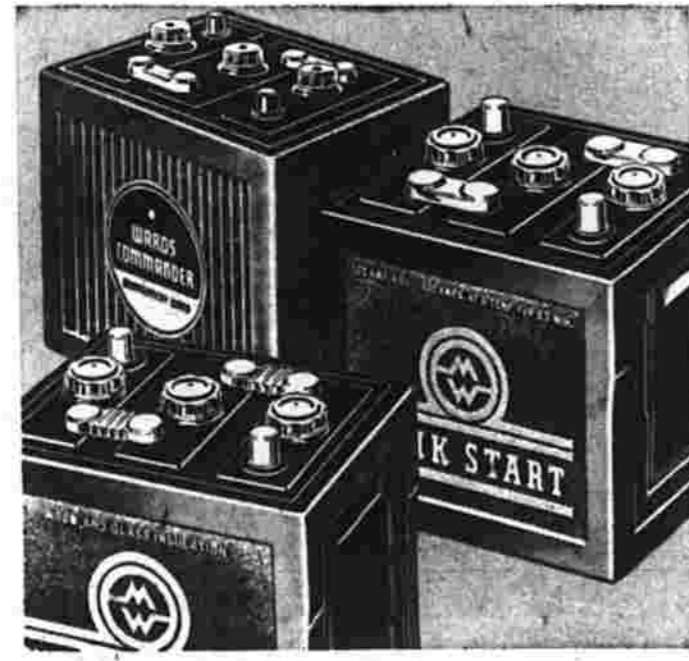
WARDS COMMANDER 3.97 ... GUARANTEED 6 MONTHS Exchange

Bed, Chest and Dresser .....129.88 4-Pc. Suite, Bed, Chest, Vanity and Dresser.....139.88