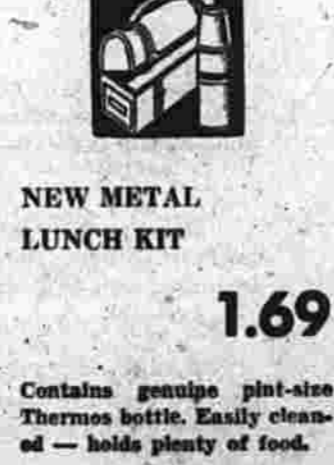
NEW METAL LUNCH KIT 1.69

Covers 100 square feet... colorful ceramic-granule surface! Nails and lap cement included.