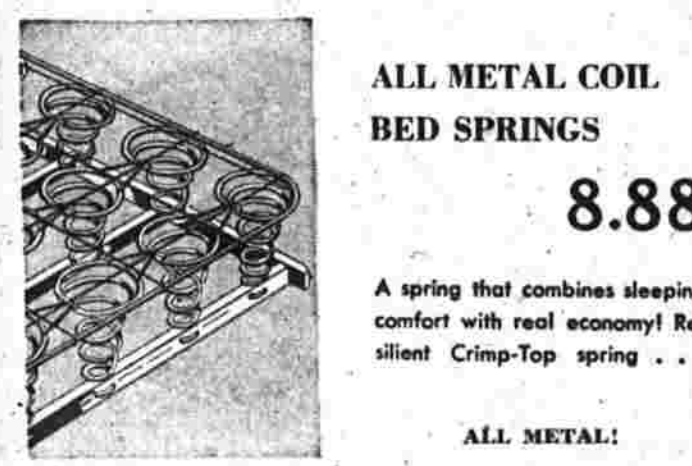
ALL METAL COIL BED SPRINGS 8.88

Wards famous "Magic Seal" cooker, with all the pre-war features! (A flip-of-the-thumb seals it!) Fully equipped for cooking and canning! Holds 7 qt.-sars, or 9 pts.