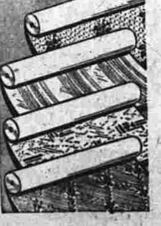
SAVE AT WARDS ON WALLPAPER 12c A Roll

Contains genuine pin-side Thermos bottle. Easily cleaned — holds plenty of food.