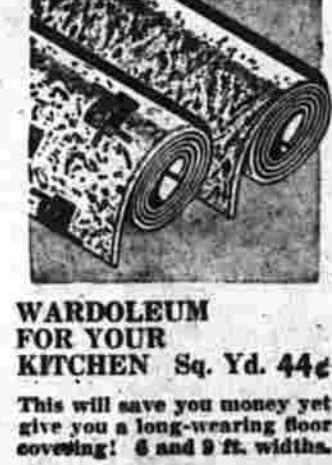
WARDOLEUM FOR YOUR KITCHEN Sq. Yd. 44c

Get this long wearing linoleum... the colors go clear through to the base. Colors won't fade or wear off. Easy to keep clean and comes in smart colors. Pre-waxed surface. See it at Wards.