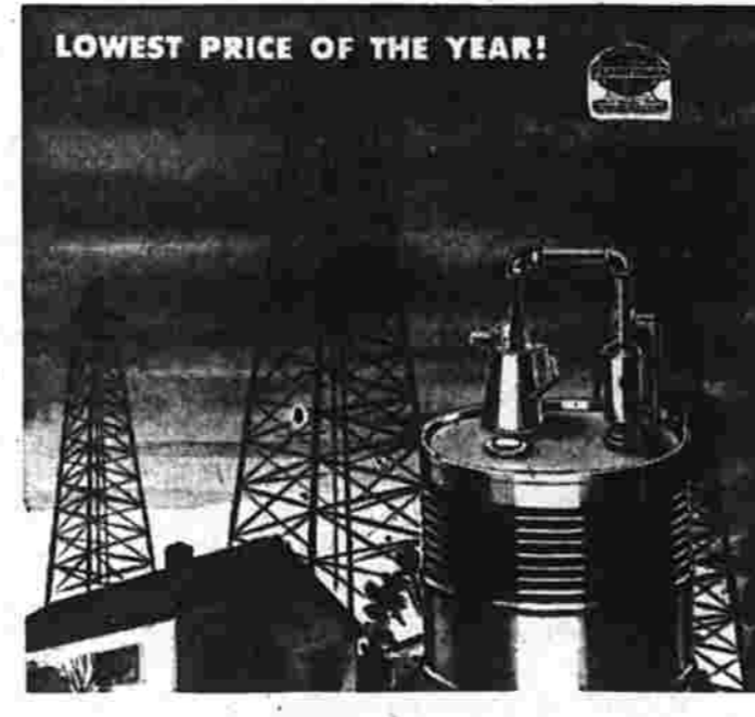
WARDS "SUPREME QUALITY" 100% PURE PENNSYLVANIA 13c

20 standard plates... 40 ampere-hour capacity. A dependable, economical battery for average starting and accessory service.