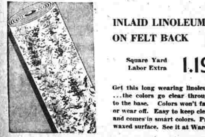
INLAID LINOLEUM ON FELT BACK 1.19

Equals most famous and costliest! Self-polishing... it shines as it dries. (Dries in 20 minutes.) Seals floors with a glossy wear-resisting finish. Contains Carnauba Wax — most durable known.