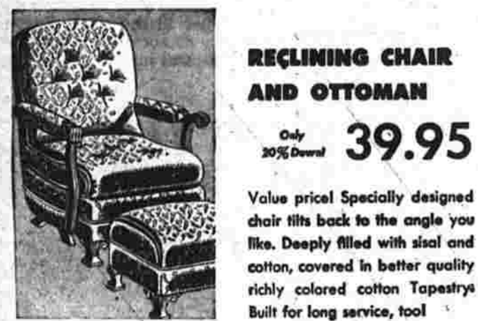
RECLINING CHAIR AND OTTOMAN 39.95

Big savings on the finest oil that money can buy! Wards "Supreme Quality" oil comes from costly Bradford Allegheny crudes. Then, it's triple-filtered and double-dewaxed to be impurity free! Long-lasting... free-flowing—gives top lubrication for cars, trucks and tractors. Bring all your containers. In 55-gallon drums, plus Fed. tax, drum deposit.....48c gal.