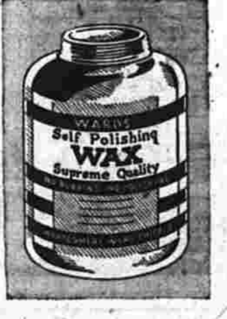
SELF-POLISHING WAX NOW REDUCED 1.88

Just arrived at Wards! No priorities of any sort are needed!