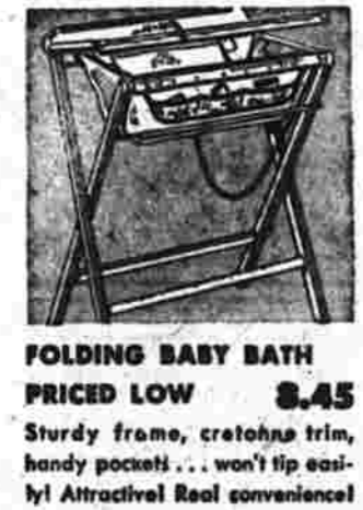
FOLDING BABY BATH PRICED LOW 8.45

A spring that combines sleeping comfort with real economy! Resilient Crimp-Top spring... ALL METAL!