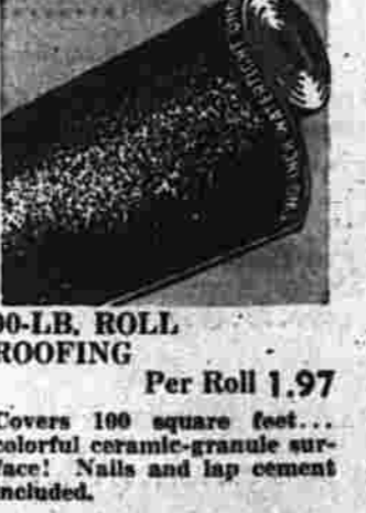
90-LB. ROLL ROOFING Per Roll 1.97

Heaviest, longest-wearing at this price! Buy to make your rugs feel thicker, last longer! Waffle top!