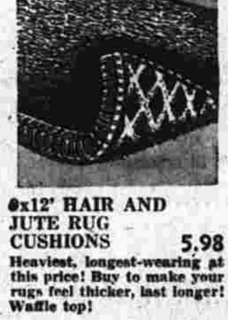
8x12" HAIR AND JUTE RUG CUSHIONS 5.98

This will save you money yet give you a long-wearing floor covering! 8 and 9 ft. widths.