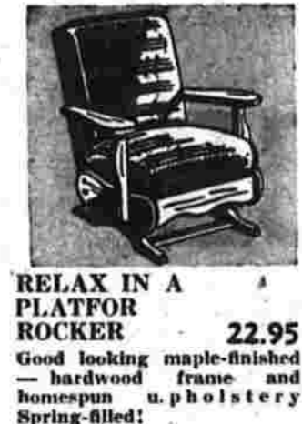
RELAX IN A PLATOROCKER 22.95

Value price! Specially designed chair fits back to the angle you like. Deeply filled with steel and cotton, covered in better quality richly colored cotton Tapstry. Built for long service, too!