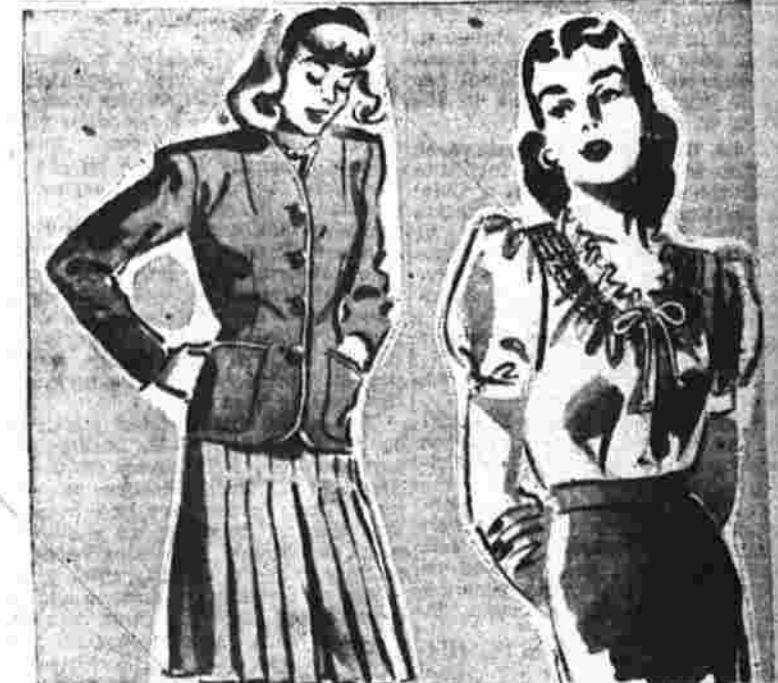
Everything You Want In Sportswear

is right here in our shiny new department. Here are only a few suggestions: Pure Wool Jackets in Classic, Blazer or Loafer Styles... 8.98 Skirts of Rayon or Spun Rayon, as Bright as Spring .....2.98 and 3.98 Blouses and Sweaters for Everyone, Priced From 2.98 to 4.98