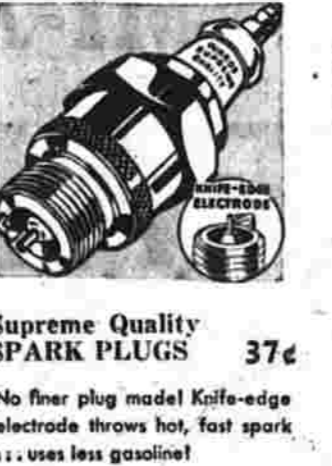
Supreme Quality SPARK PLUGS 37c

Give her this roomy 44-inch chest. Rich V-matched veneers. Lined with protective RED CEDAR.