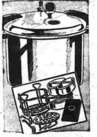
CAST ALUMINUM PRESSURE COOKER 17.50

Granules .....17c Complexion Soap ....3c Borax Soap .....3c