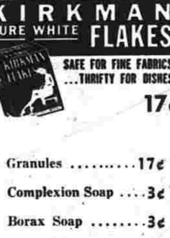
KIRKMAN PURE WHITE FLAKES 17c

No finer plug model Kofa-edge electrode throws hot, fast spark... uses less gasoline!