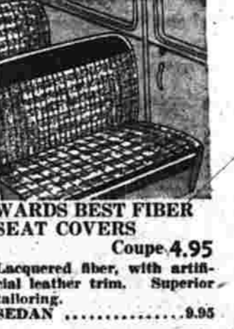
WARDS BEST FIBER SEAT COVERS Coupe 4.95

Sturdy steel frame folds compactly. Safety brakes, non-slip, storm shield protect baby!