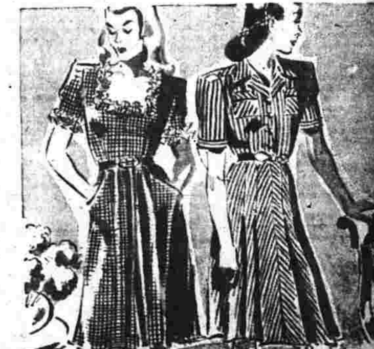
NEED A FRESH NEW COTTON? 4.98

We've Other Pretty New Spring Dresses. Priced From .....3.98 to 9.98