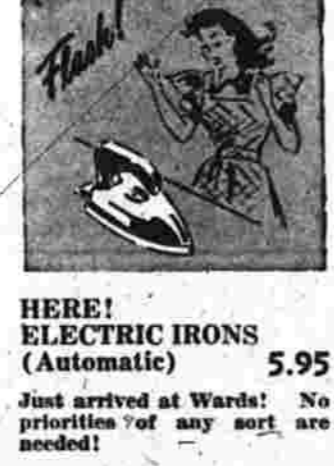
HERE! ELECTRIC IRONS (Automatic) 5.95

Lacquered fiber, with artificial leather trim. Superior tailoring. SEDAN .....8.95